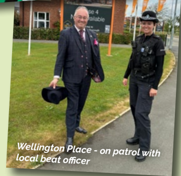
Wellington Place - on patrol with local beat officer